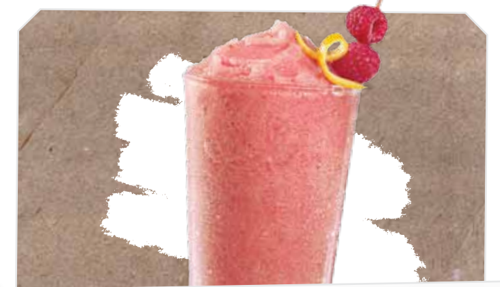
{ Red Bull Frozen Infusion }