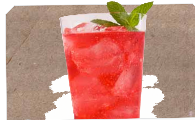
{ Red Bull Iced Infusion }